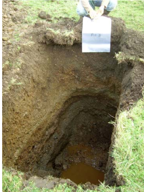
Figure 2: Photograph of a typical sample pit at Huequi showing approximately one metre of overburden overlying a one metre thick gravel horizon.