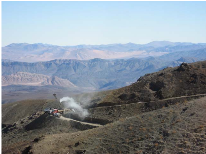
Figure 1: Reverse Circulation drilling at La Perla. The mineralised structure is to the right of the picture. The drillhole has been angled to intersect the structure at depth.

A programme of reverse circulation drilling comprising six boreholes to a total depth of 1,146 metres has been completed at La Perla. Samples have been submitted for analysis and results should be available within two to three weeks.